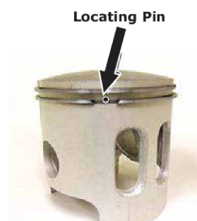
Figure 2 - Ring Locating Pin