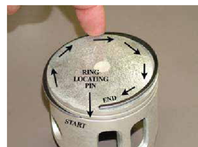
Figure 1 - Install rings